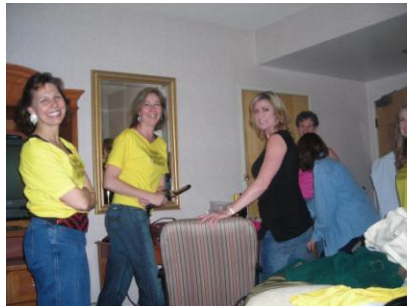
2007 Golddiggers getting ready at the Radisson.

What is a Golddigger?? A Soroptimist dancer. A Soroptimist member, who is willing to take off her tailored suit, put on the themed outfit of the year (this year it will be a black blues brother suit) and dance. We have lots of fun practicing, laughing and bonding. These are the good times!