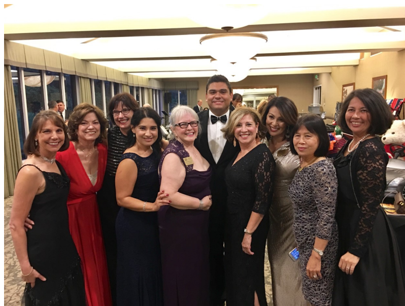
Boys & Girls Club Gala